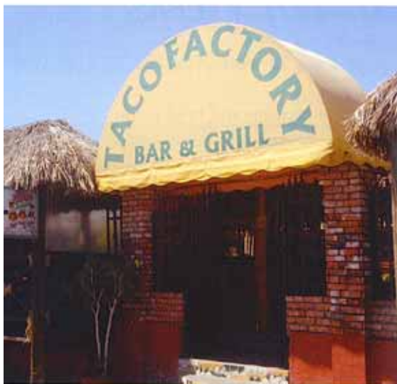
Barry was thrilled to learn that the fish taco was invented in San Felipe. They are available on every street corner.

Hmm, maybe my next trip will be one way.